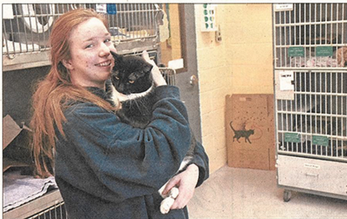
A volunteer with the Animal Welfare Association of Voorhees holds Tuxie, a domestic shorthair mix. Registration is now open for the AWA's Paws and Feet 5K Race/Walk & Doggie Fun Day on June 11. Funds raised from the event help AWA continue to provide services to thousands of animals a year.