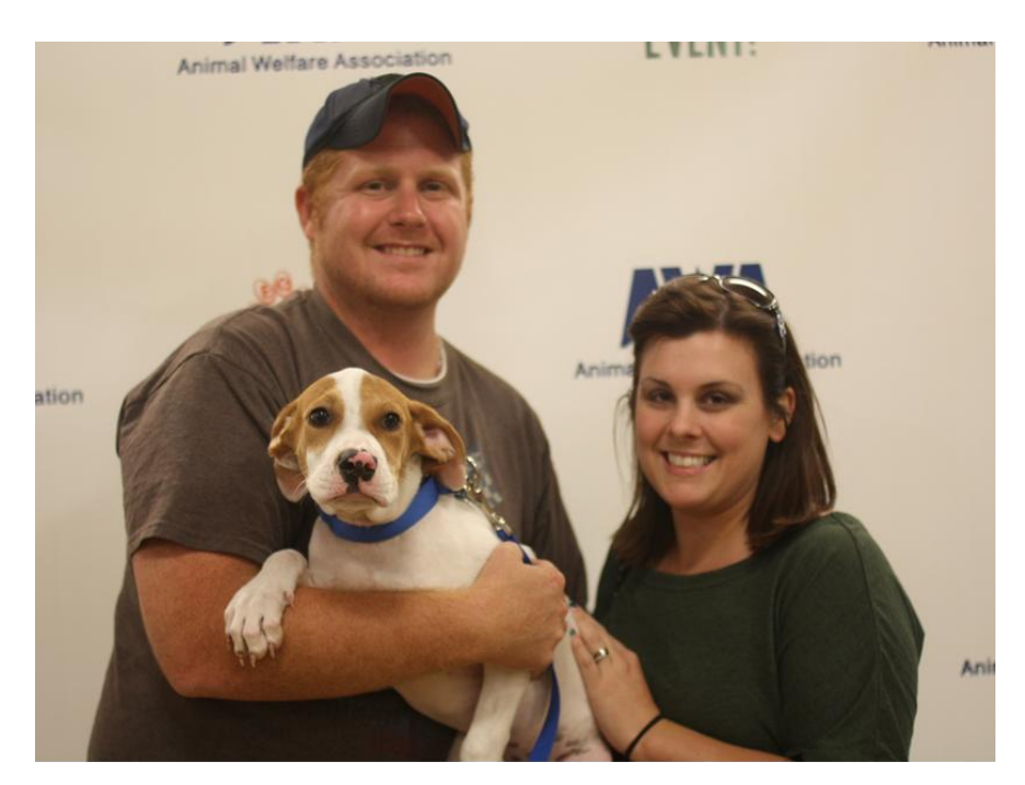
CT Couple Adopts Kiwi